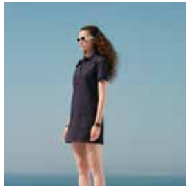
74 Carina dress, CLDR0653/436, brown, navy blue.