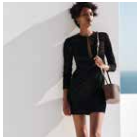
68-69 Marsya dress, CLDR0642/001, black.