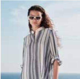
80 Hera blouse, CLBL0378/435, ivory, navy.