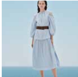
72 Anemone dress, CLDR0658//087, sky blue.