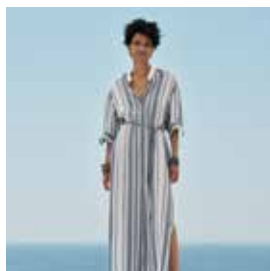
84 Maira dress, CLDR0644/435, ivory, navy.