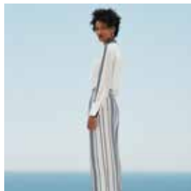
82 Ivy shirt, CLSR0150/435, ivory, navy. Kynthia trousers, CLTR0304/435, ivory, navy.