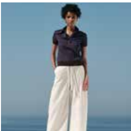
76-77 Phoebe top, CLTP0293/436, brown, navy blue. Atreas trousers, CTR0295/007, beige.