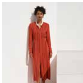
86 Hera dress, CLDR662/434, scarlet red.